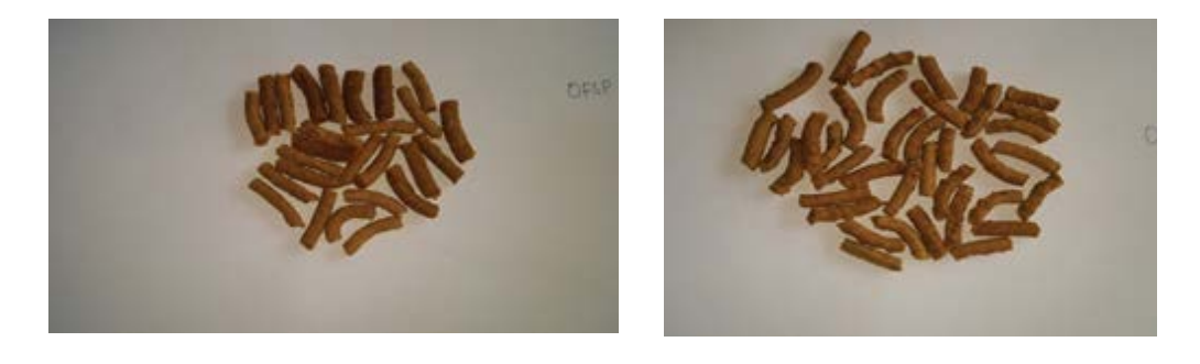
OFSP OFSP1 Figure 2. Photographs of the extruded RTE snacks from OFSP and bambara groundnut (OFSP =100% OFSP, OFSP1 = 80% OFSP + 20% Bambara)